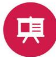
Large science festivals and fairs