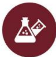
STEM Club activities