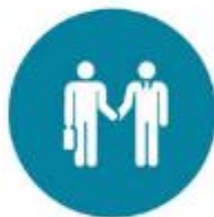
Site visits and hosting work experience