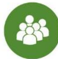
Community and youth groups